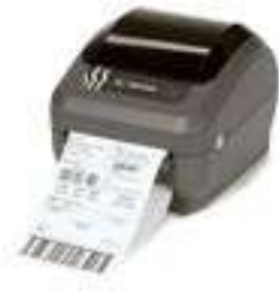
Figure 4 ZEBRA GK420D

Be sure to get a USB model, or pay extra and get one with a networking port, for easy network connectivity.