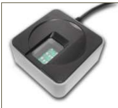
Figure 5a: Futronics FS88