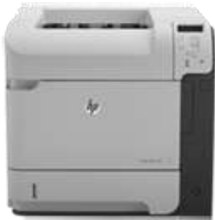
Figure 2 HP LASERJET M601dn

If you are a larger shop or you anticipate a higher volume then a good choice is the HP M601dn , which is physically larger but more heavy-duty