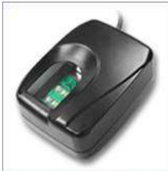
Figure 5: Futronics FS80