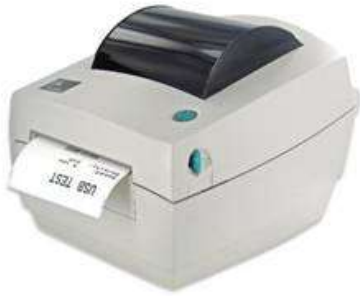
Figure 3: ZEBRA Model LP2844