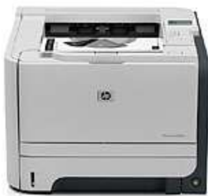
Figure 1: HP LASERJET P3015dn

A highly recommended medium-volume model is the HP LASERJET P3015dn . They keep changing model no's, so be flexible.