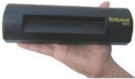
Figure 6: Scanshell 800R scanner