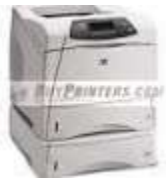
HP 4300dtn printer

You can also get very good deals on a reconditioned HP LASERJET 4300 series,. They aren't manufactured any more but they are a very solid machine. Example below, but we are not recommending this particular vendor above any other: